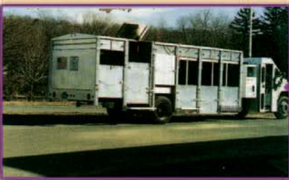
36 CY WITH COMPACTOR