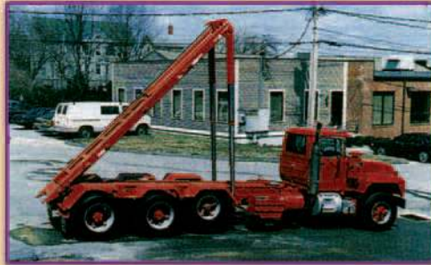
"PREMIER" ROLL-OFF SYSTEM