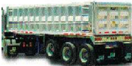
DynaHauler®/FTA, steel frame, aluminum body dump trailer. A high-performance trailer for excavation and other types of construction material hauling.