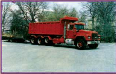
20 CY DUMP BODY WITH TRAILER

CONTAINERS • ROLL OFFS RECYCLING EQUIPMENT • BALERS SLUDGE CONTAINERS ROLL-OFF HOISTS TRANSFER STATIONS RECYCLING TRUCKS & BODIES