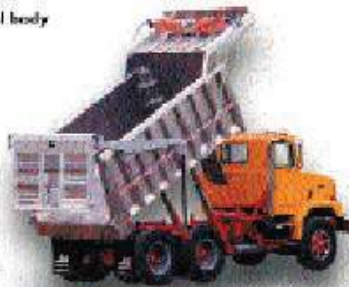
DynaHauler®/MH4, is one of our most popular material haulers. Optional twin hoist suspension provides greater stability on uneven ground surfaces.