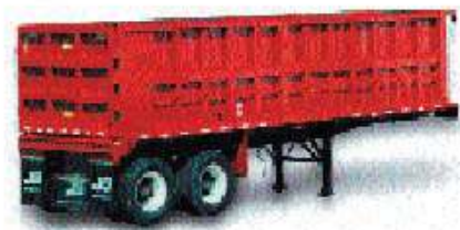
DynaHauler®/DT, a demolition dump trailer engineered for the most rugged work.