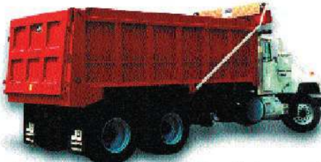
DynaHauler®/ILWC, a lightweight, crossmemberless steel body that features newly designed bottom rails.