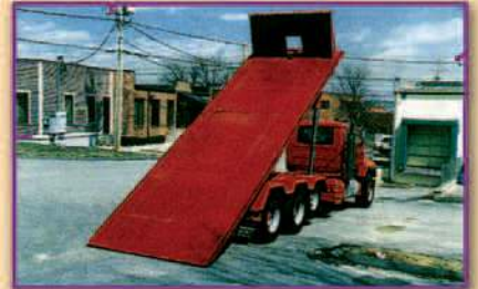
ROLL-OFF FLAT BED

CONTAINERS • ROLL OFFS RECYCLING EQUIPMENT • BALERS SLUDGE CONTAINERS ROLL-OFF HOISTS TRANSFER STATIONS RECYCLING TRUCKS & BODIES