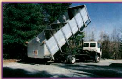
"NATIONAL RECYCLING" BODIES