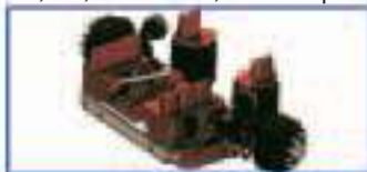
Watson & Chalin and Silent- Drive Lift Axles