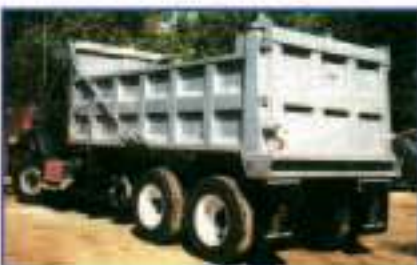
Brandon/Beau-Roc T-1 Steel "Lightweight Heavy Strength" NO SALES TAX IN NH!