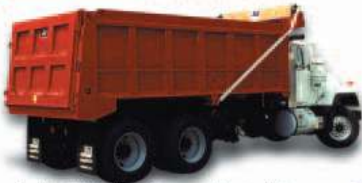
DynaHauler®/LWC, a lightweight crossmemberless steel body that features newly designed formed bottom rails.

ISO 9001 Certified. Quality products, quality workmanship.