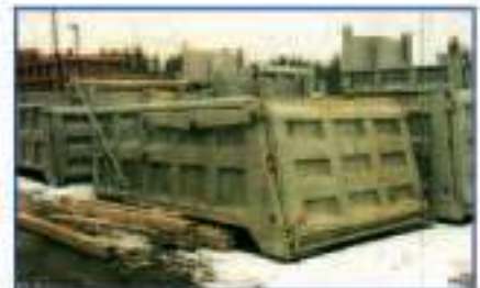
(1) 14' x 54" x 102" Rock Bodies Autogates & Electric Covers Call for Special Prices