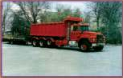
20 CY DUMP BODY WITH TRAILER

CONTAINERS • ROLL OFFS RECYCLING EQUIPMENT • BALERS SLUDGE CONTAINERS ROLL-OFF HOISTS TRANSFER STATIONS RECYCLING TRUCKS & BODIES