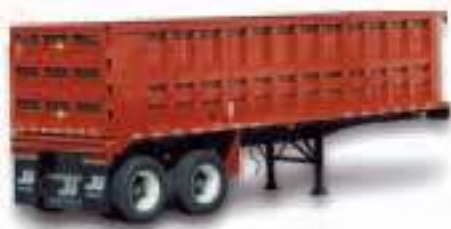
DynaHauler®/DT, a demolition dump trailer engineered for the most rugged work.