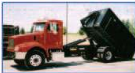
Hook-All Hook Lift Are now Available In 10,000#, 15,000# & 20,000# Capacities