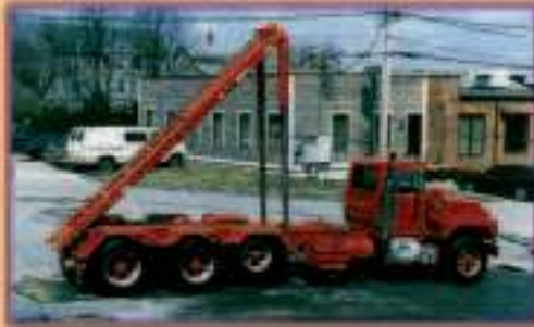
“PREMIER” ROLL-OFF SYSTEM