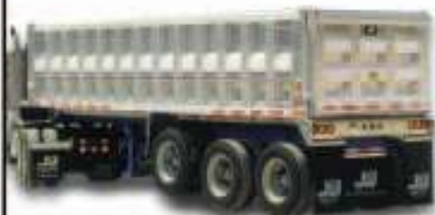
DynaHauler®/FTA, steel frame, aluminum body dump trailer. A high-performance trailer for excavation and other types of construction material hauling.

A Division of Somerset Welding and Steel, Inc. 10558 Somerset Pike Somerset, PA 15501 USA 814.443.2671 / fax: 814.445.9303 Email: sales@jjbodies.com