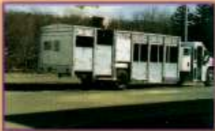
36 CY WITH COMPACTOR