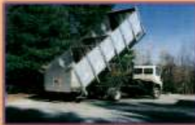
“NATIONAL RECYCLING” BODIES