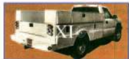
Stahl GCX Service Bodies

BEAU-ROCK • GODWIN • FISHER BRANDON • HARSH • STAHL • TAFCO