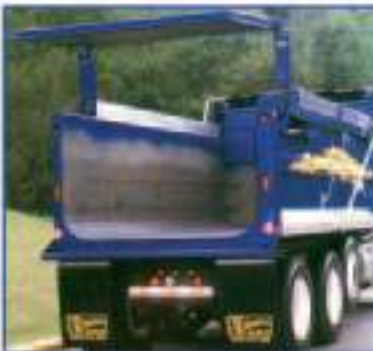
Introducing R/S Bodies Steel & Aluminum