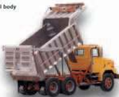
DynaHauler®/MH, is one of our most popular material haulers. Optional twin hoist suspension provides greater stability on uneven ground surfaces.