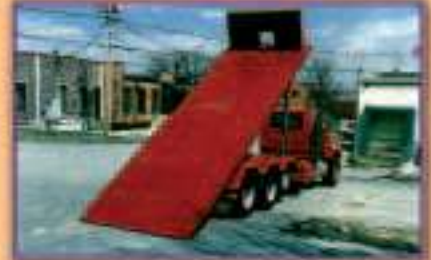
ROLL-OFF FLAT BED

CONTAINERS • ROLL OFFS RECYCLING EQUIPMENT • BALERS SLUDGE CONTAINERS ROLL-OFF HOISTS TRANSFER STATIONS RECYCLING TRUCKS & BODIES